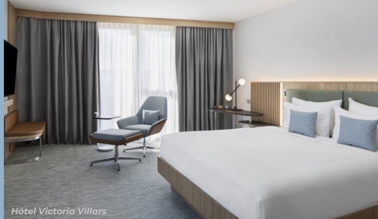
Hôtel Victoria Villars