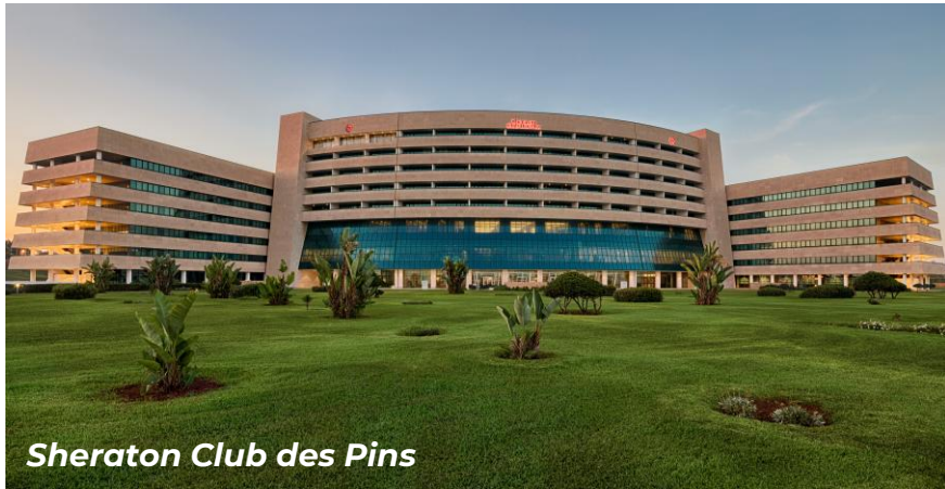
Sheraton Club des Pins