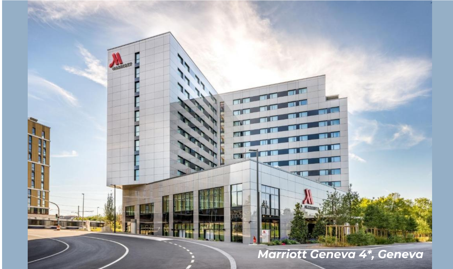
Marriott Geneva 4*, Geneva