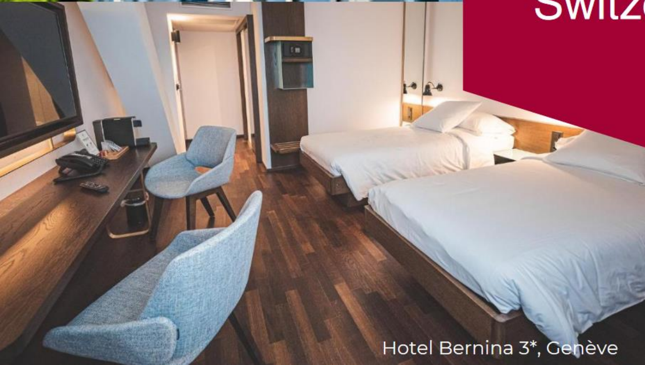
Hotel Bernina 3*, Genève