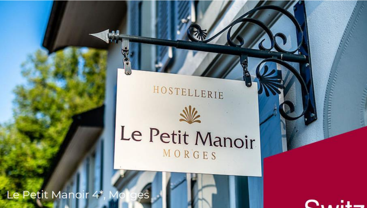
Le Petit Manoir 4*, Morges