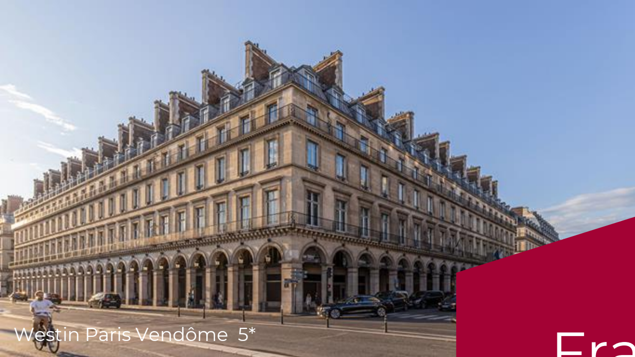
Westin Paris Vendôme 5*