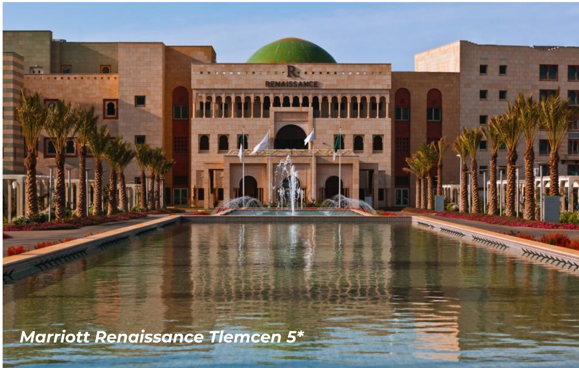
Marriott Renaissance Tlemcen 5*