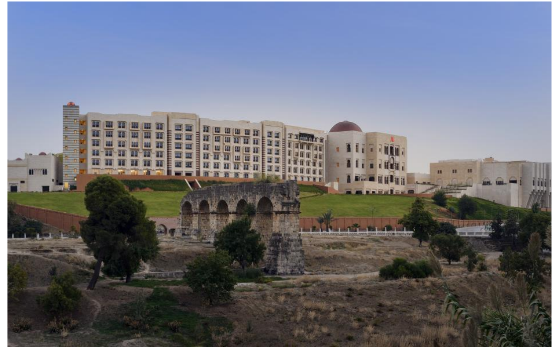
Marriott Constantine 5*

Portfolio of 5 Marriott hotels in the country