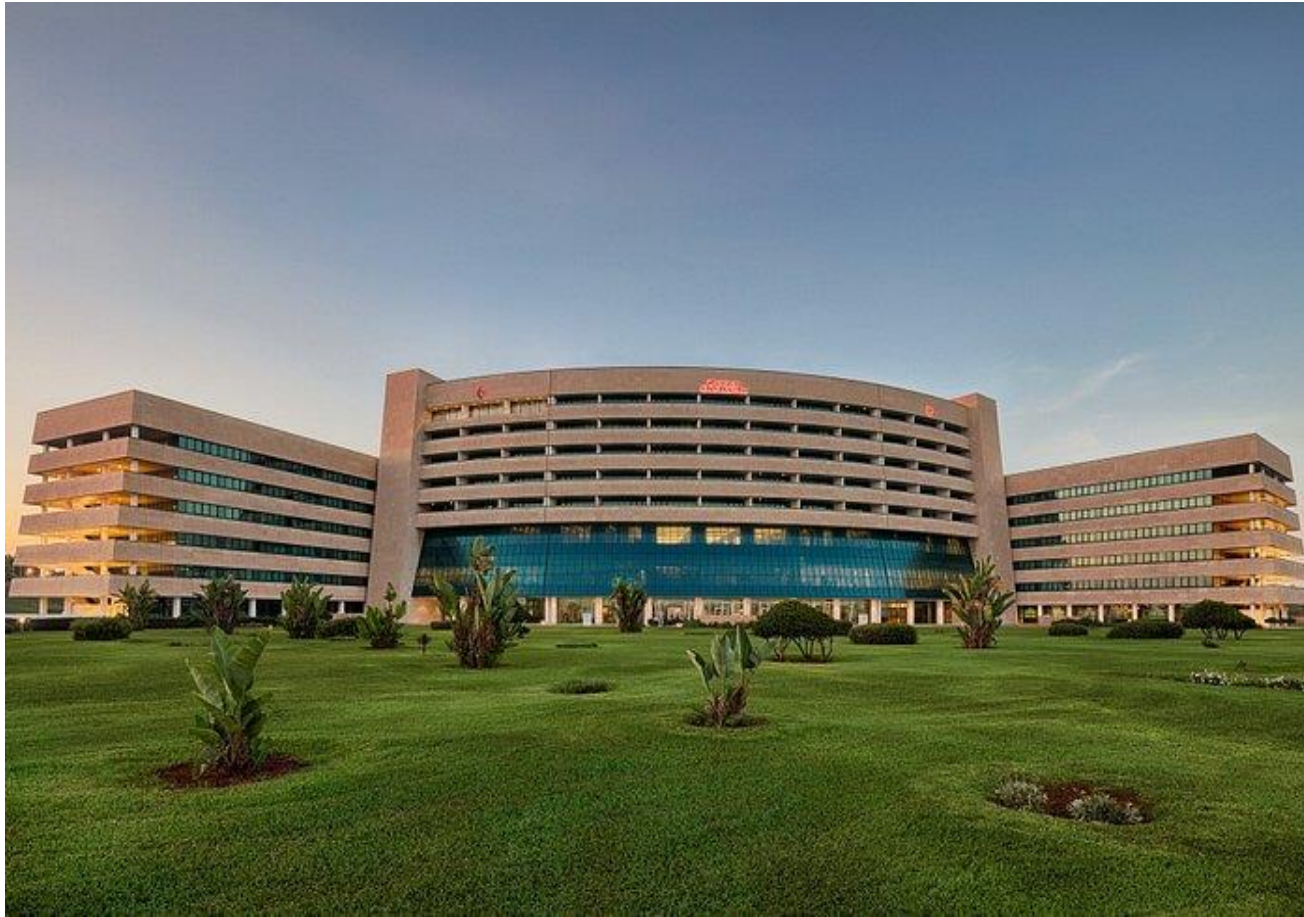
Sheraton Club des Pins Resort 5*, Algier