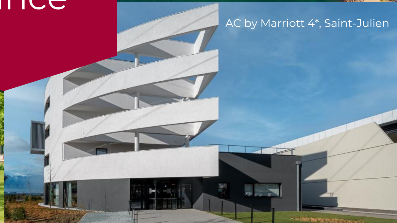
AC by Marriott 4*, Saint-Julien