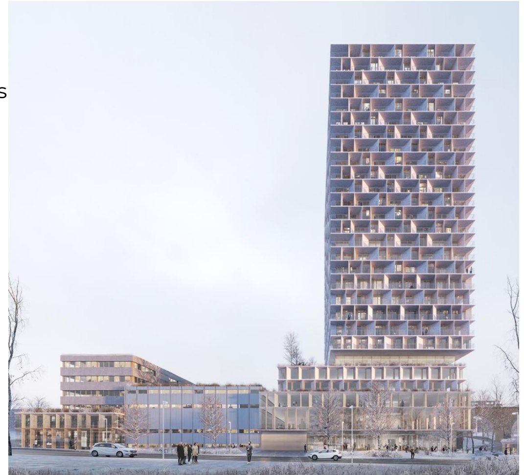
Tilia Tower Project, Lausanne