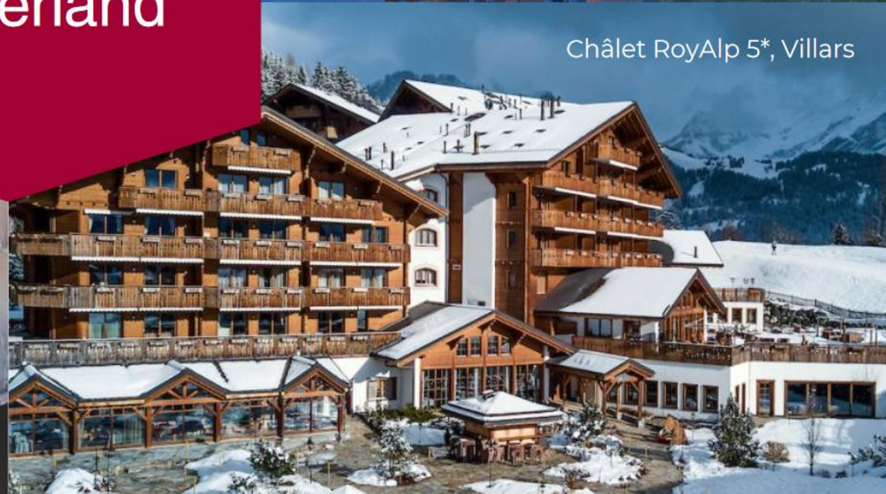
Châlet RoyAlp 5*, Villars