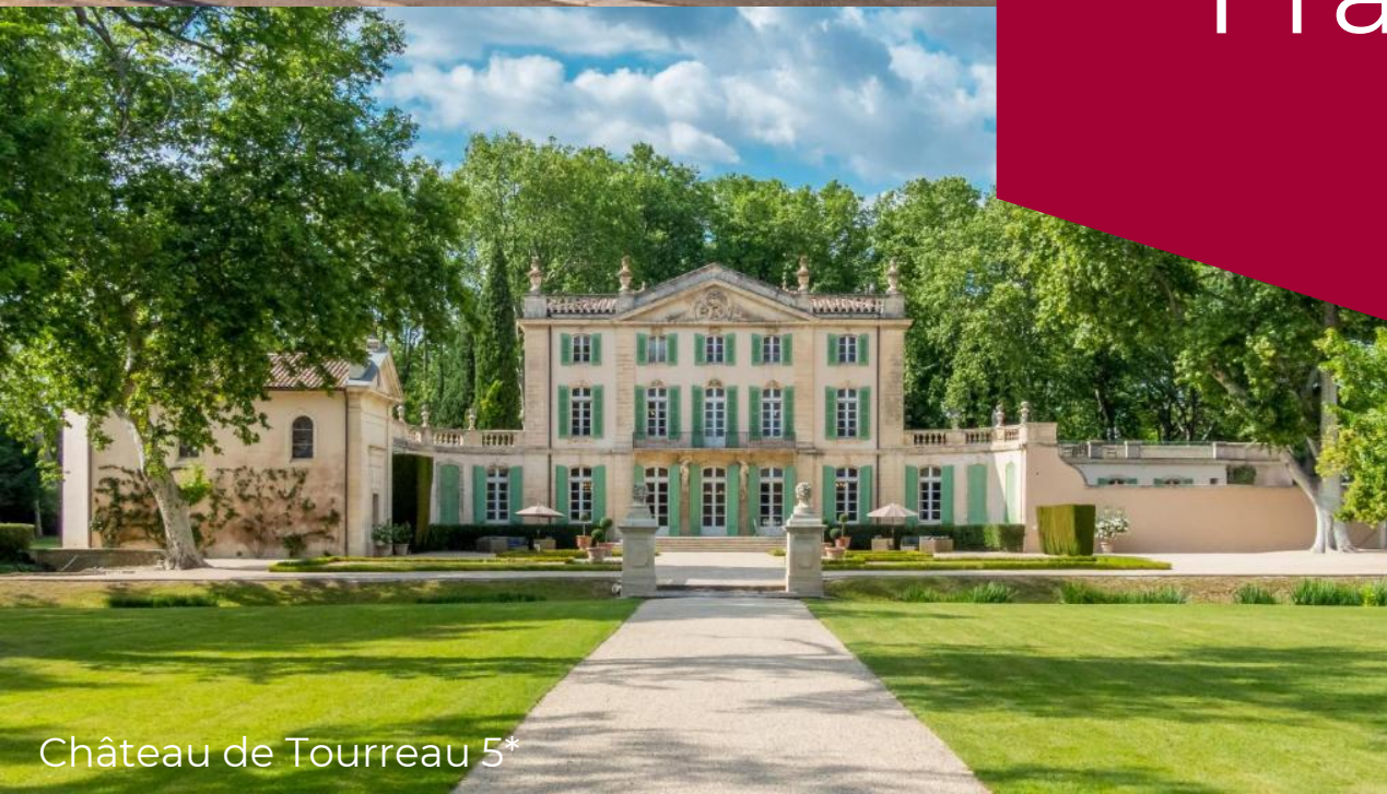
Château de Tournieu 5*