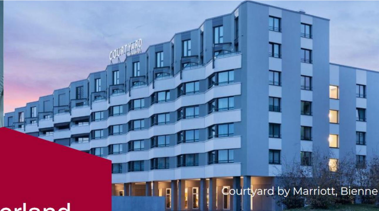
Courtyard by Marriott, Bienne